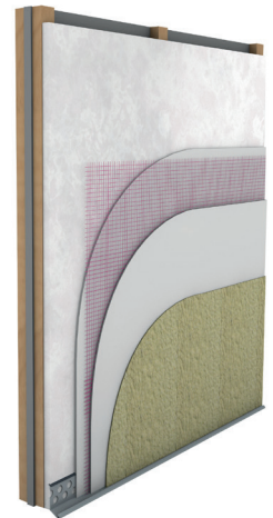
weberend MT system